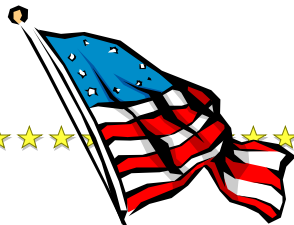
Memorial Day 2009